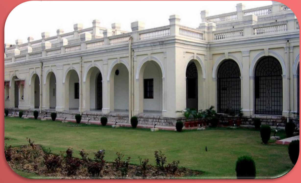
Vice Regal Lodge

Law Centre-II Umang Bhawan (North Campus) University of Delhi Phone No.: 011-27667052